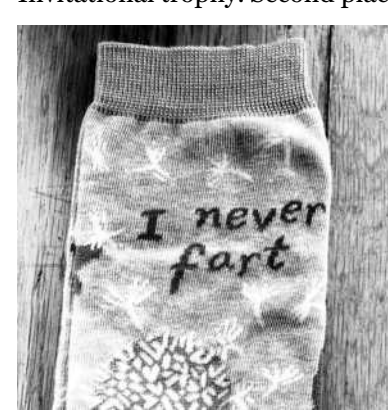
Maybe the socks' idea is to warn people you might explode?

inner gets the Clowning Achievement, our Style Invitational trophy. Second place receives a pretty pair of